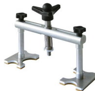
Mini Puller (050921)