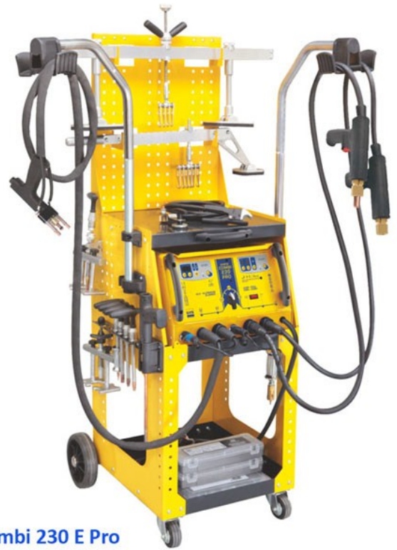
GYS Combi 230 E Pro